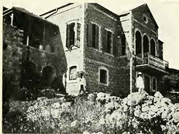
NORTH FRONT OF THE MOZAFER KHANEH